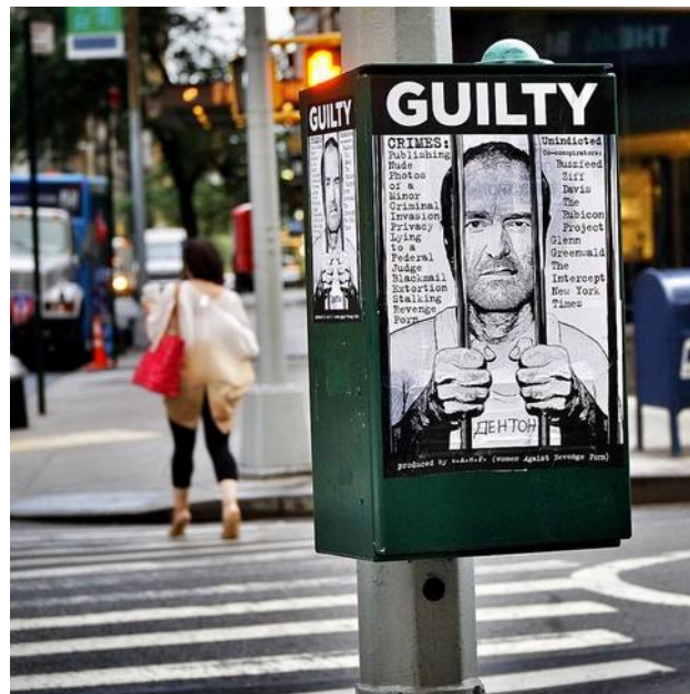
Nick Denton: Guilty as Sin?

Witnesses and investigators have hard evidence, and the FBI has hard proof, that GawkModo was hired to destroy, planned to destroy, took compensation to attack and did destroy numerous reporters, whistle-blowers and voters in vendetta, retribution and reprisal hit-jobs.